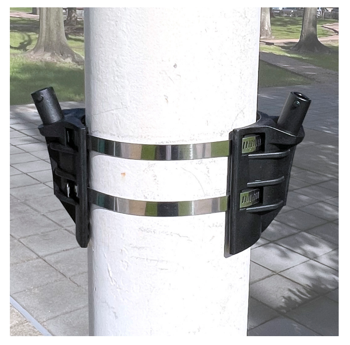
STEP 4. Wrap kit around pole. Insert the ends of the clamp' into the locks and tighten until the kit sits securely on pole.