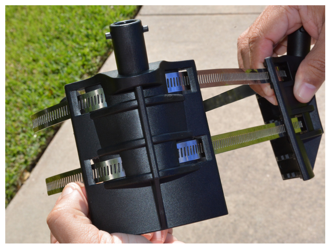
STEP 3. Repeat steps 1-2 on bottom row of slits and on remaining brackets.