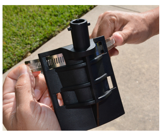
STEP 2. Slide strap (E) through remaining slits. Strap must go through all slits to ensure bracket (D) remains secure on strap.