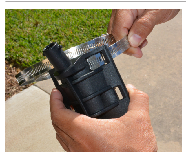
STEP 1. Begin by adding clamp strap (E) through the slit on the back of the bracket (D).