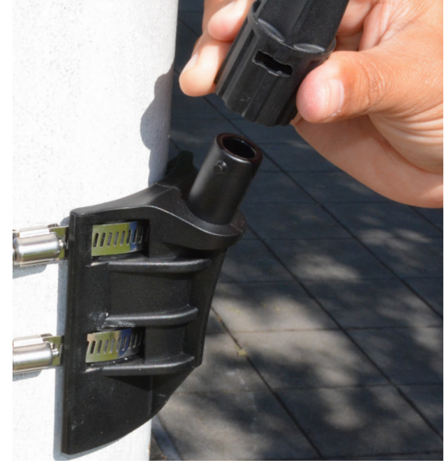
STEP 5. Twist and lock balloon stems (C) onto each bracket.